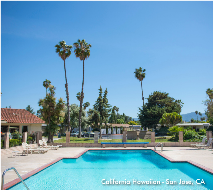
California Hawaiian - San Jose, CA