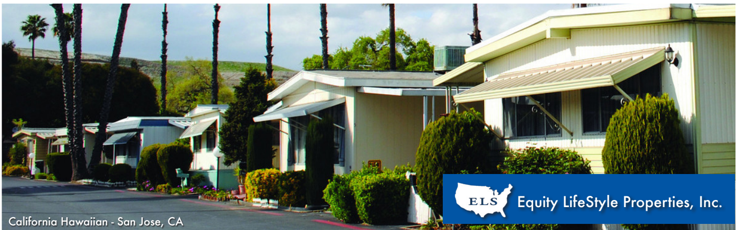
California Hawaiian - San Jose, CA