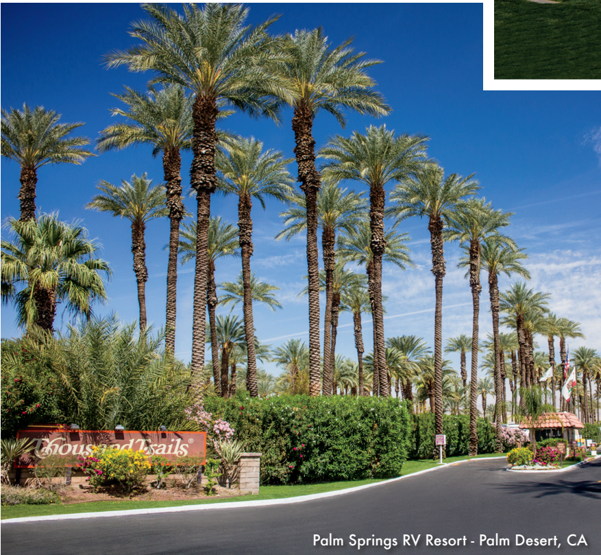
Palm Springs RV Resort - Palm Desert, CA