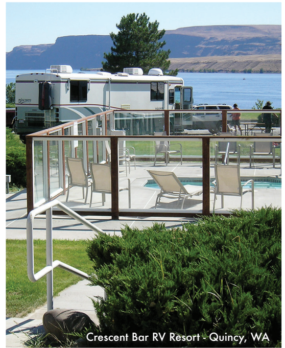
Crescent Bar RV Resort - Quincy, WA