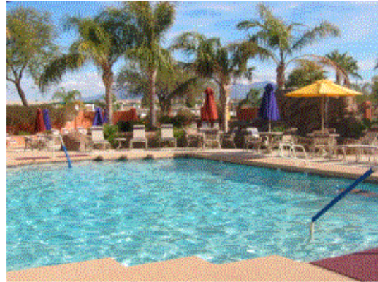
Monte Vista Resort - Mesa, Arizona