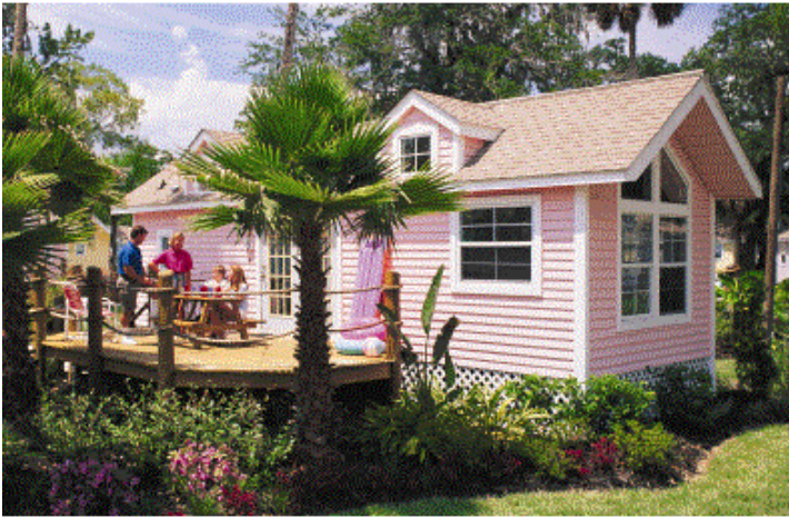
Tropical Palms-Orlando, Florida Vacation Cottage Daily Rates: $90 - $150