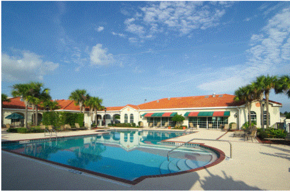
Coquina Crossing – St. Augustine, Florida