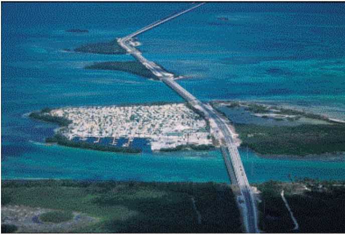
Sunshine Key RV Resort & Marina Florida Keys Sites: 409 Marina Slips: 172