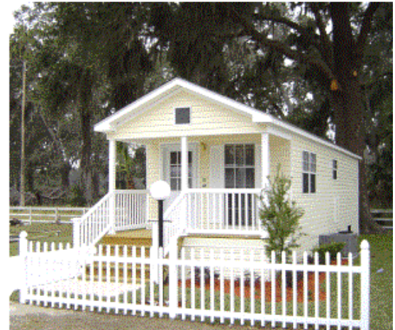
Bulow Plantation-Daytona, Florida Resort Cottage Square Footage: 400 Sales Price: $40,000 Annual Rent: $4,300