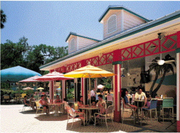
Tropical Palms RV Resort Orlando, Florida Sites: 541