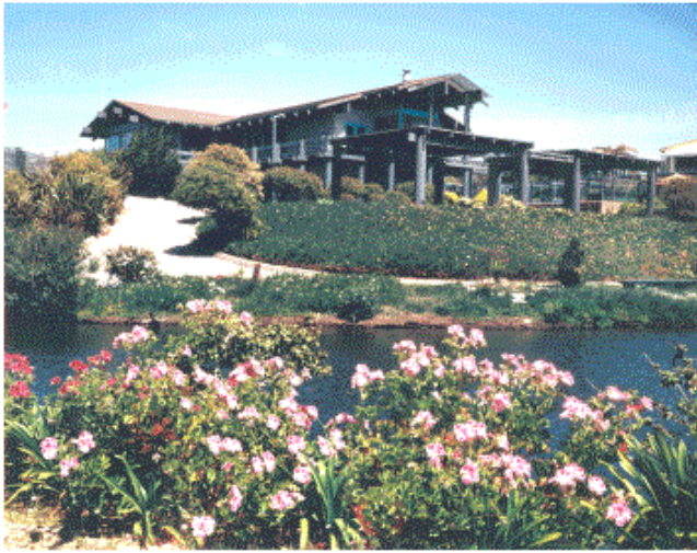
Santa Cruz Pacific Coast, California Sites: 198