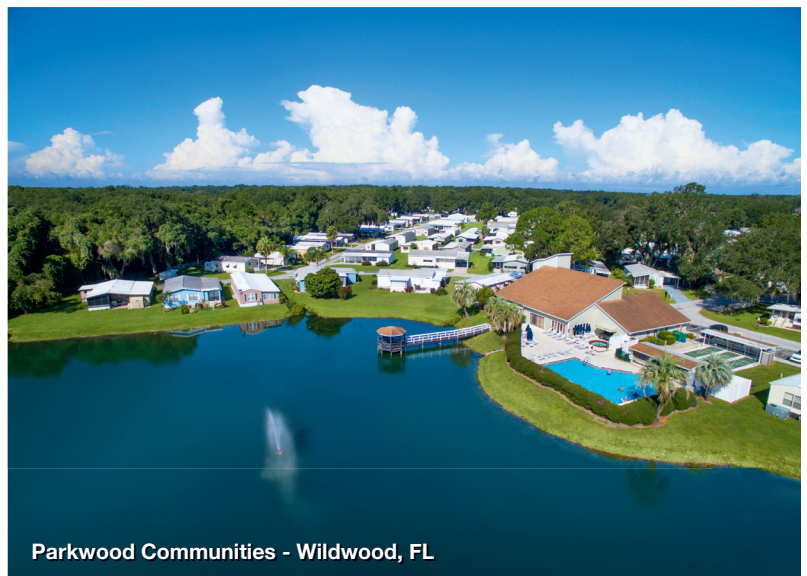
Parkwood Communities - Wildwood, FL