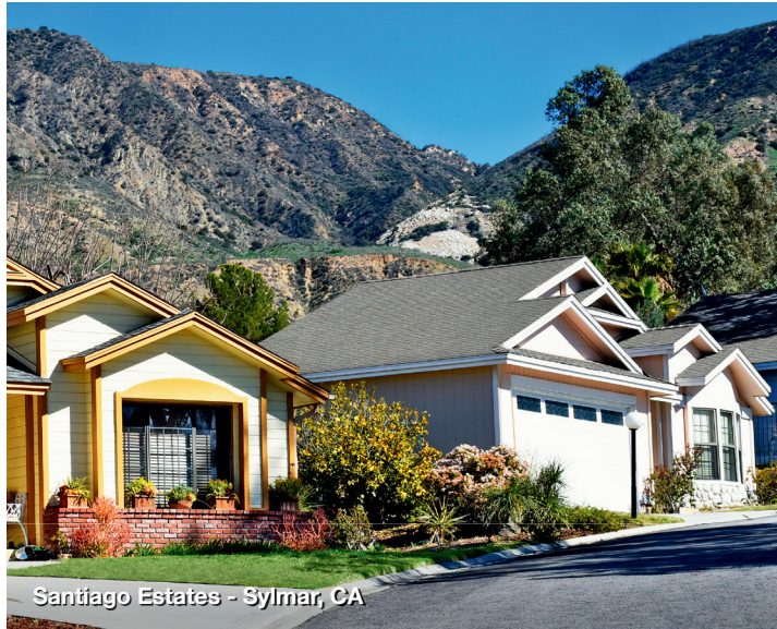
Santiago Estates - Sylmar, CA