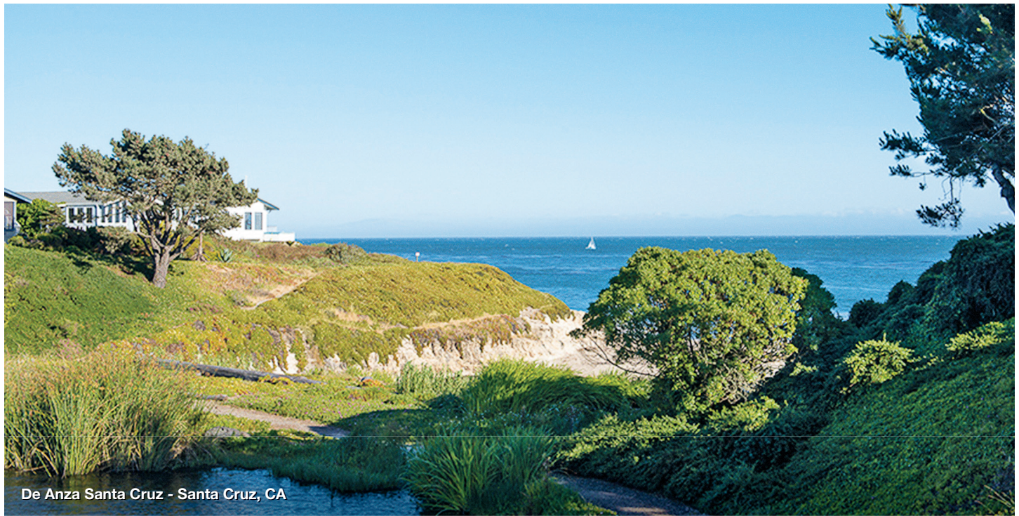
De Anza Santa Cruz - Santa Cruz, CA