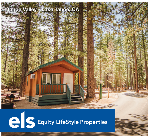
Tahoe Valley - Lake Tahoe, CA