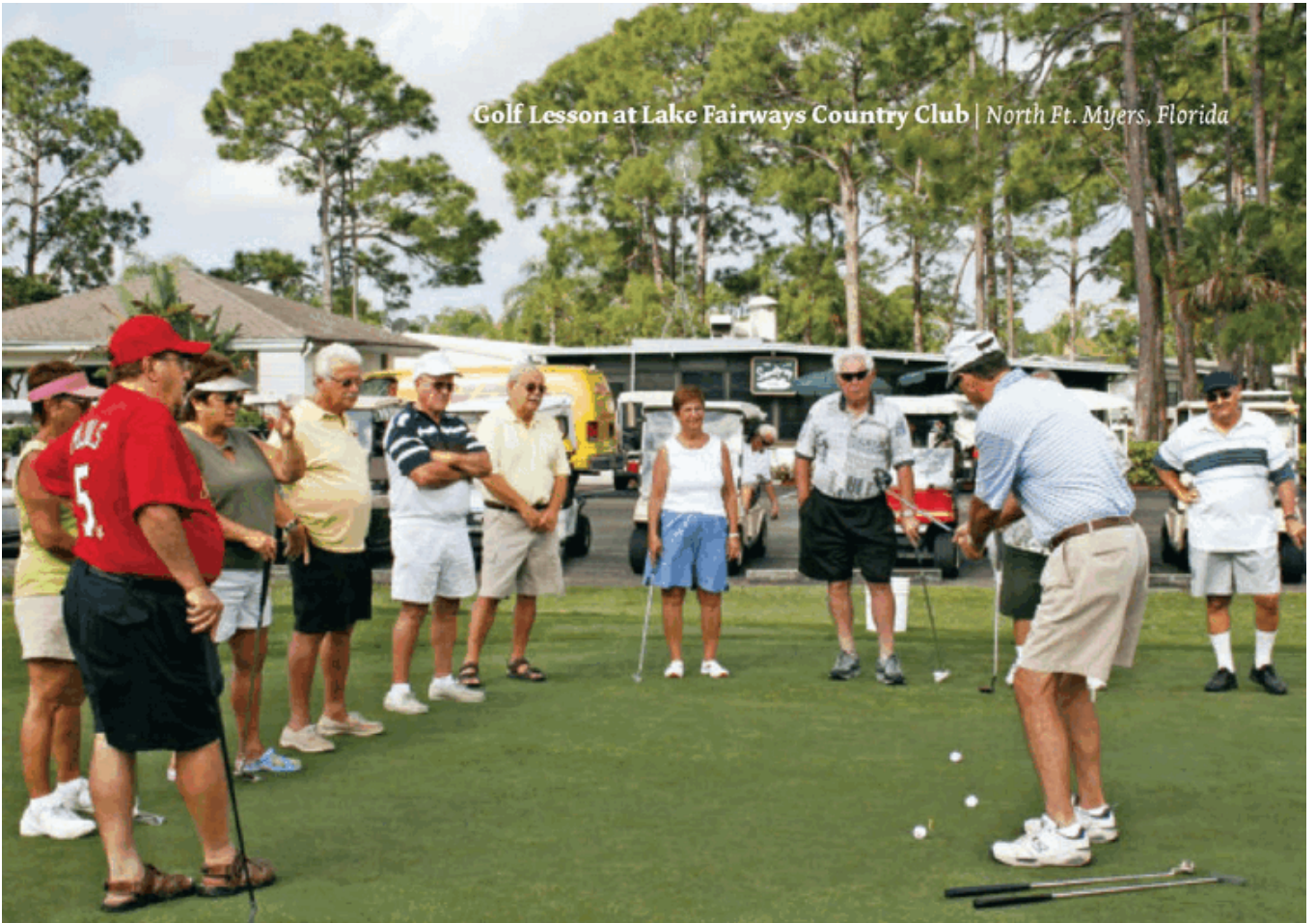
Golf Lesson at Lake Fairways Country Club | North Ft. Myers, Florida