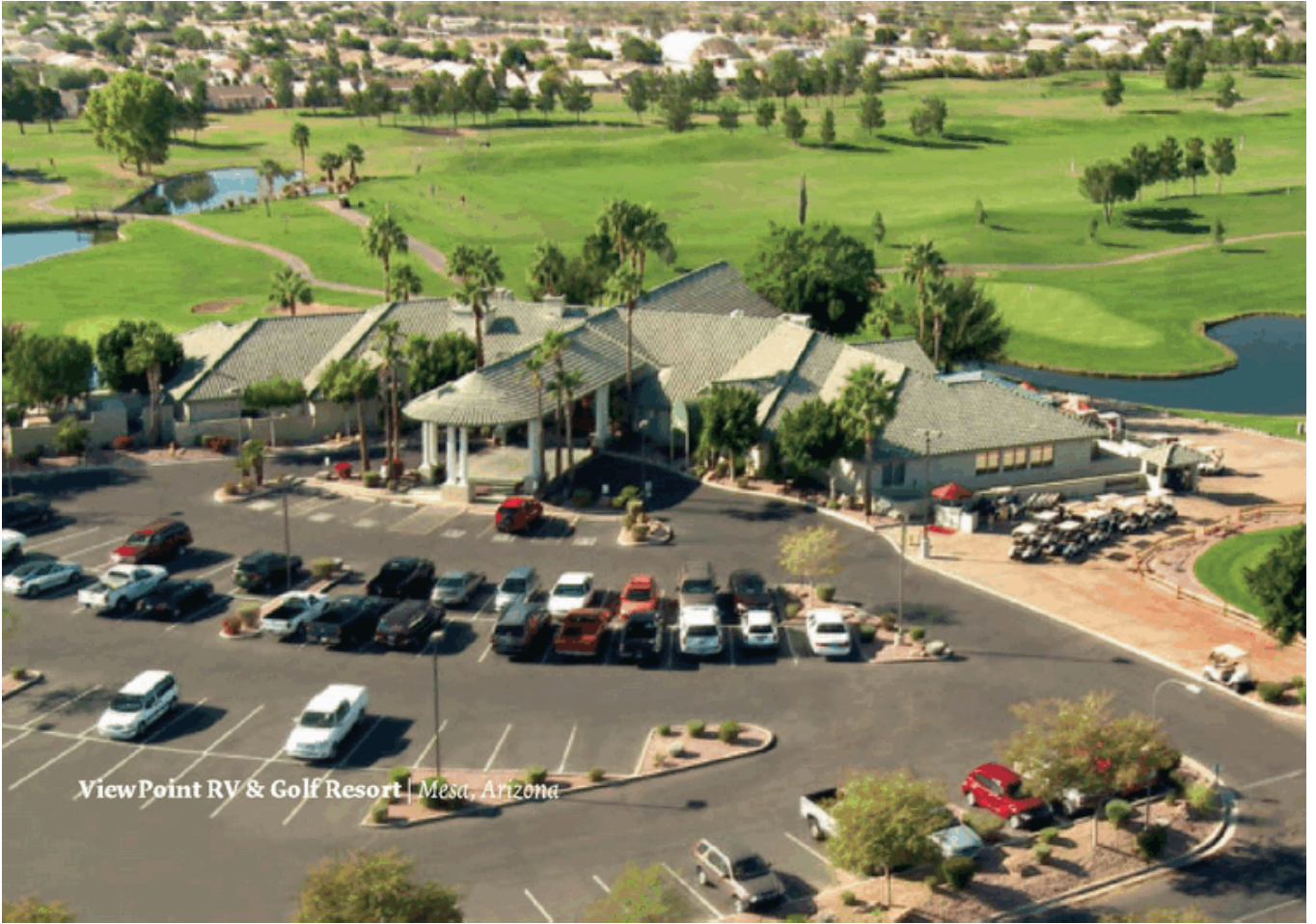
ViewPoint RV & Golf Resort | Mesa, Arizona