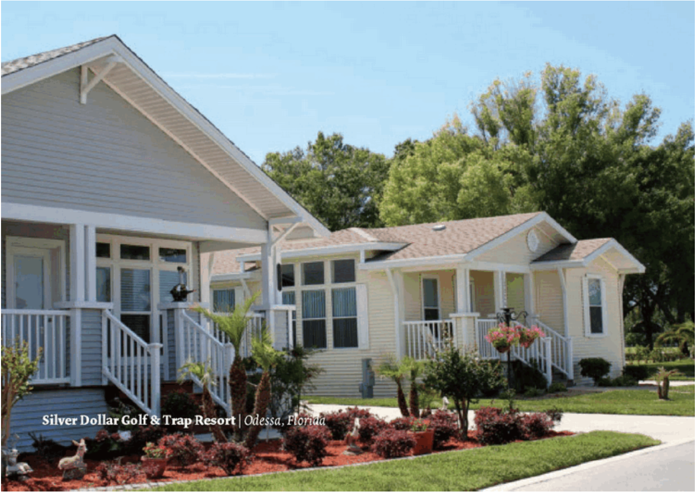
Silver Dollar Golf & Trap Resort | Odessa, Florida