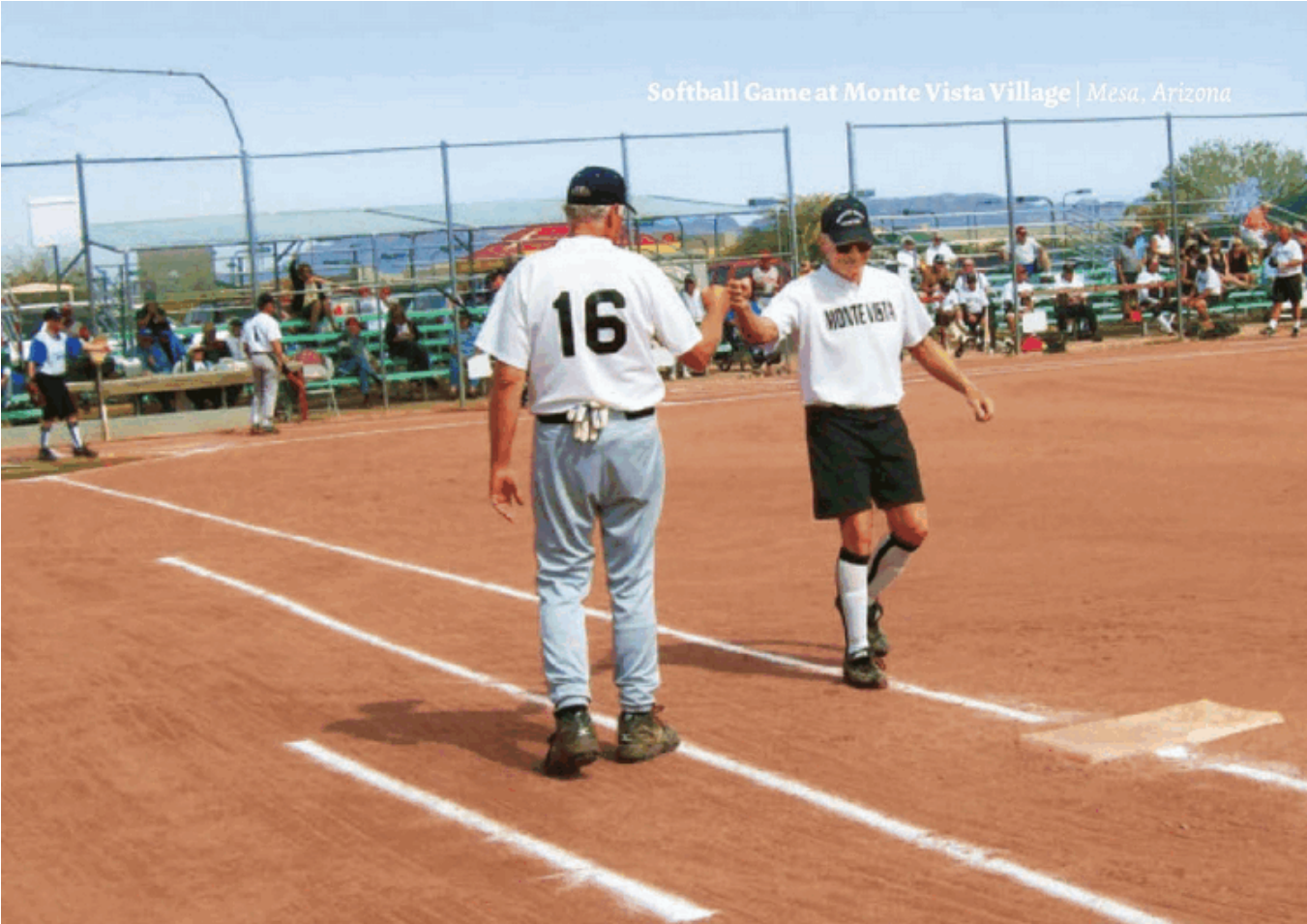
Softball Game at Monte Vista Village | Mesa, Arizona