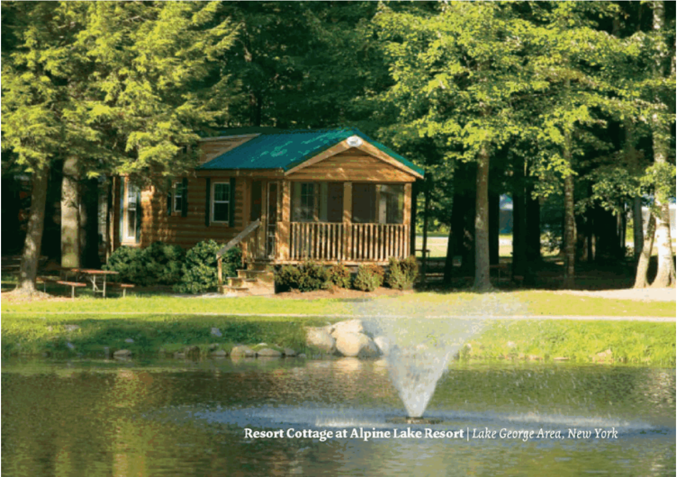
Resort Cottage at Alpine Lake Resort | Lake George Area, New York