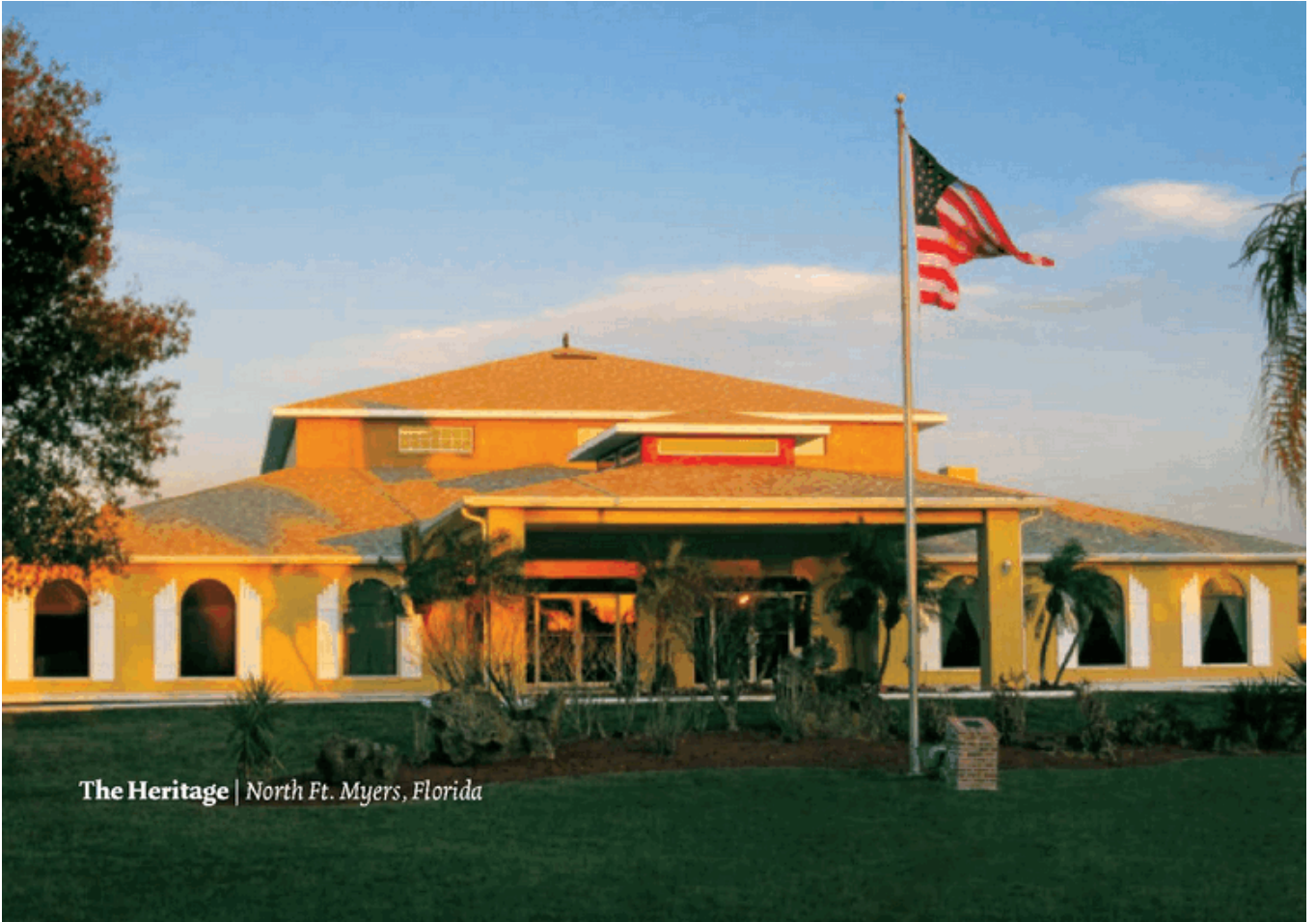
The Heritage | North Ft. Myers, Florida