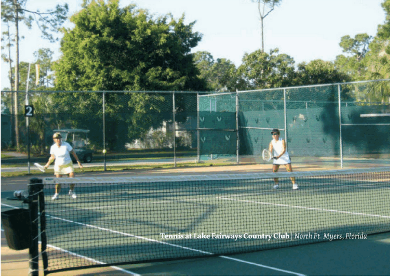
Tennis at Lake Fairways Country Club | North Ft. Myers, Florida