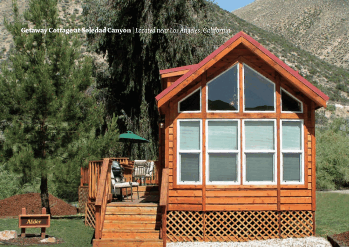
Getaway Cottage at Soledad Canyon | Located near Los Angeles, California