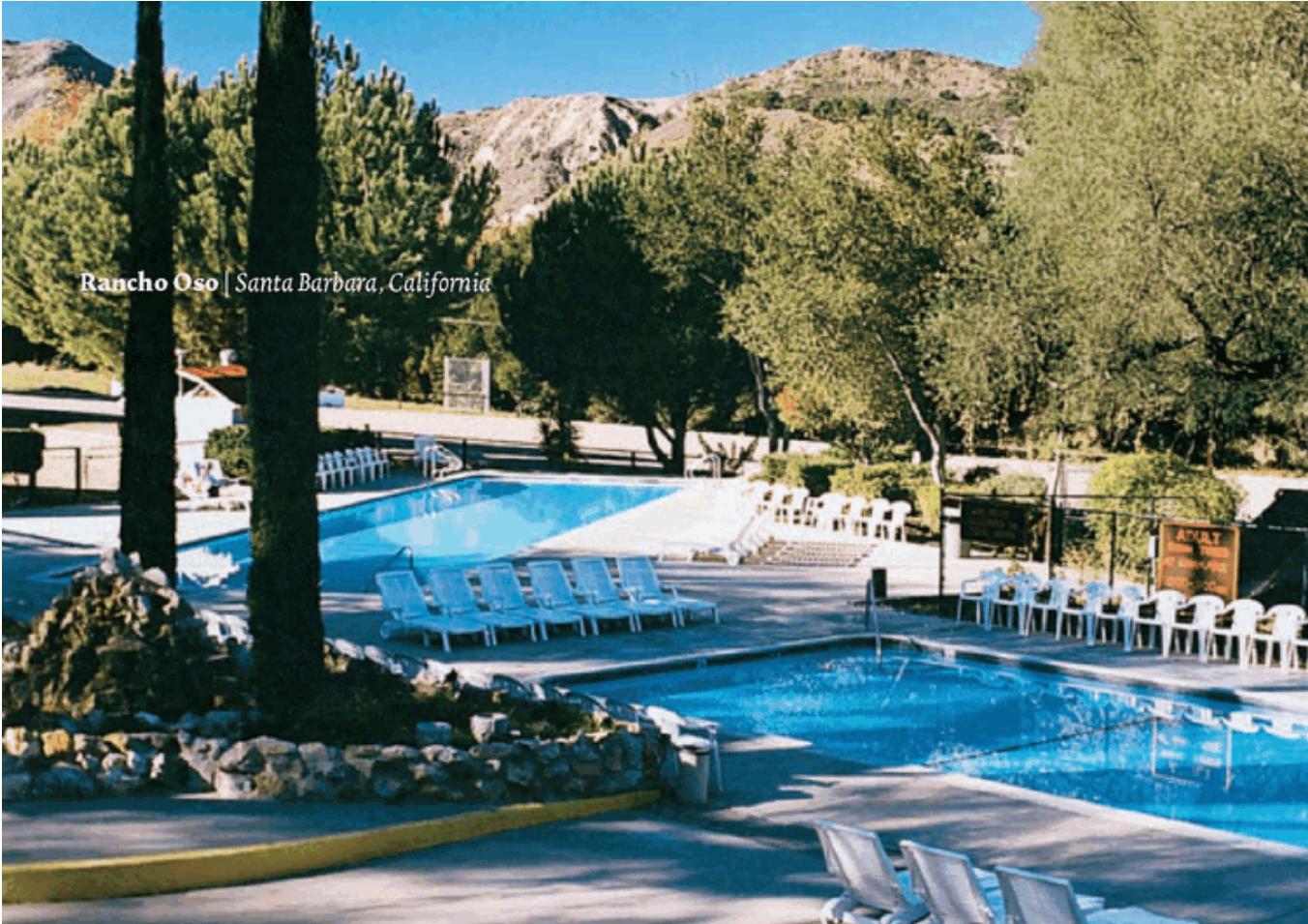
Rancho Oso | Santa Barbara, California