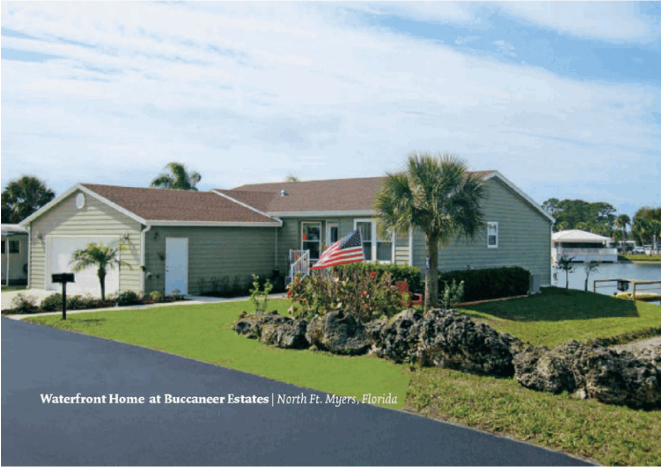
Waterfront Home at Buccaneer Estates | North Ft. Myers, Florida