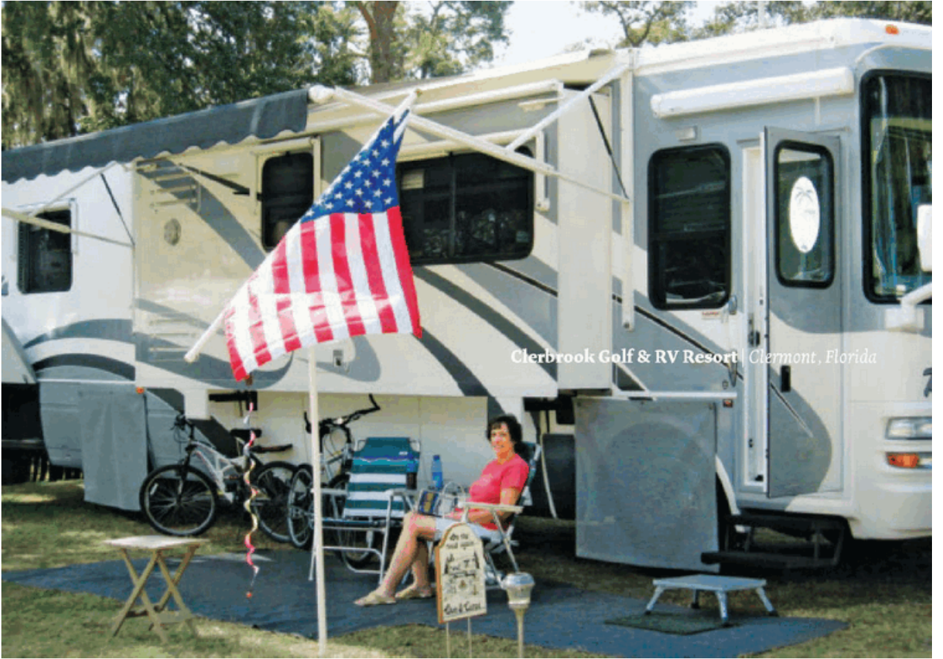
Clerbrook Golf & RV Resort | Clermont, Florida