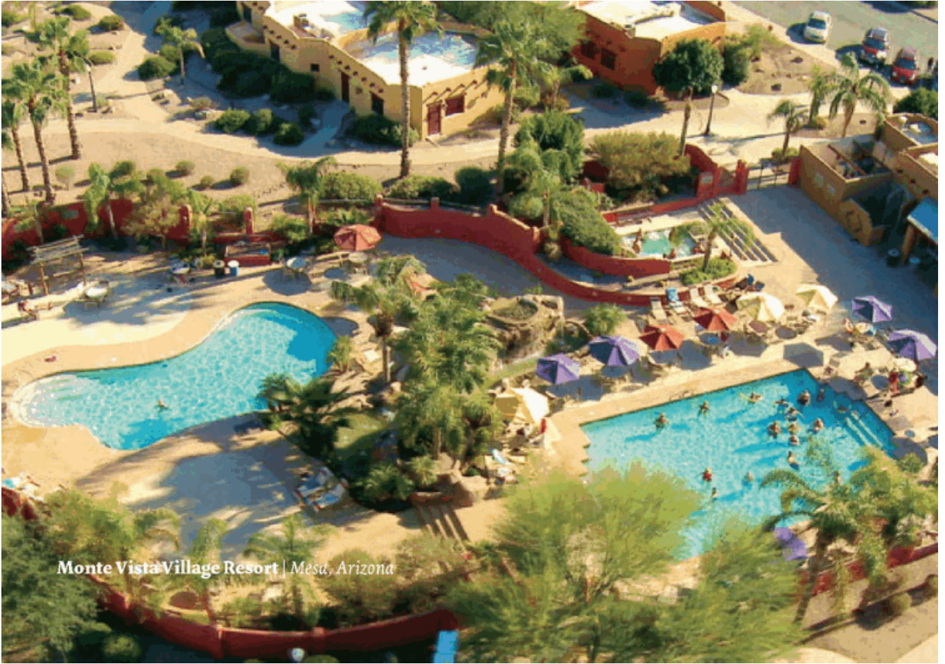
Monte Vista Village Resort | Mesa, Arizona