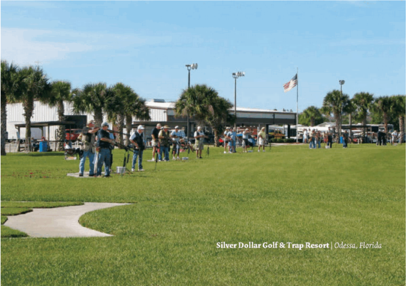
Silver Dollar Golf & Trap Resort | Odessa, Florida