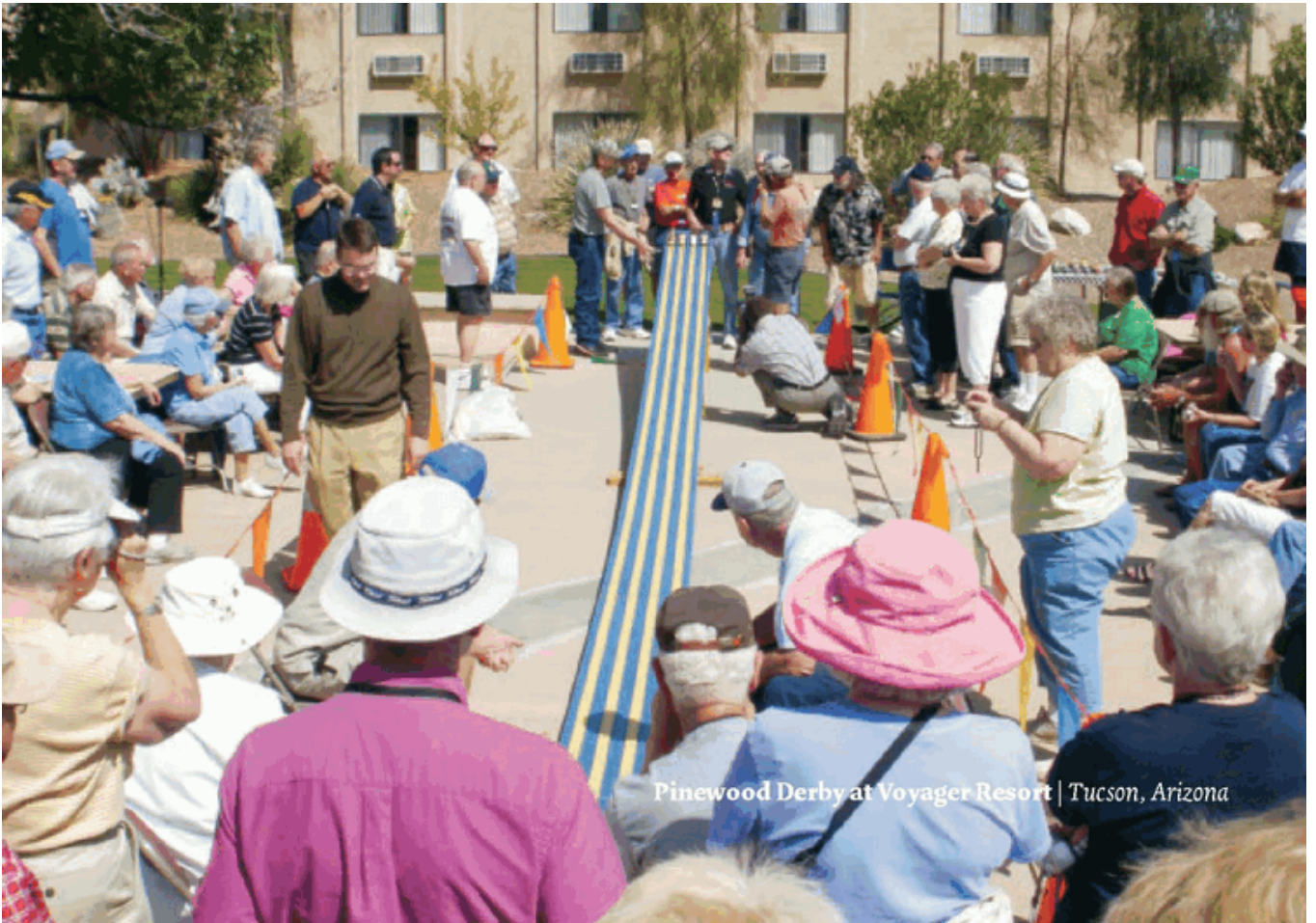
Pinewood Derby at Voyager Resort | Tucson, Arizona