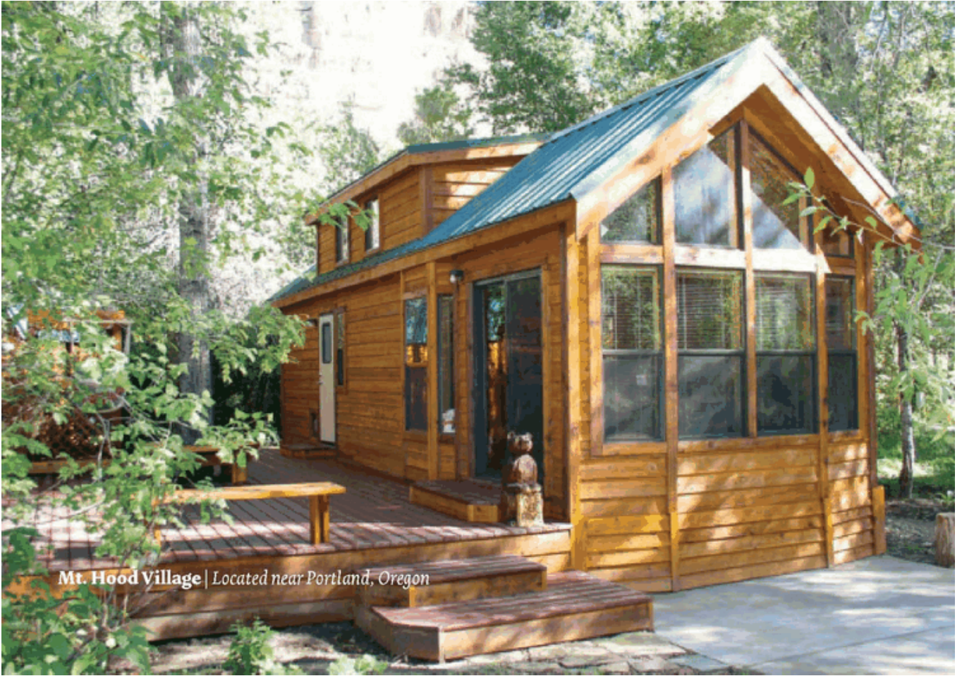
Mt. Hood Village | Located near Portland, Oregon