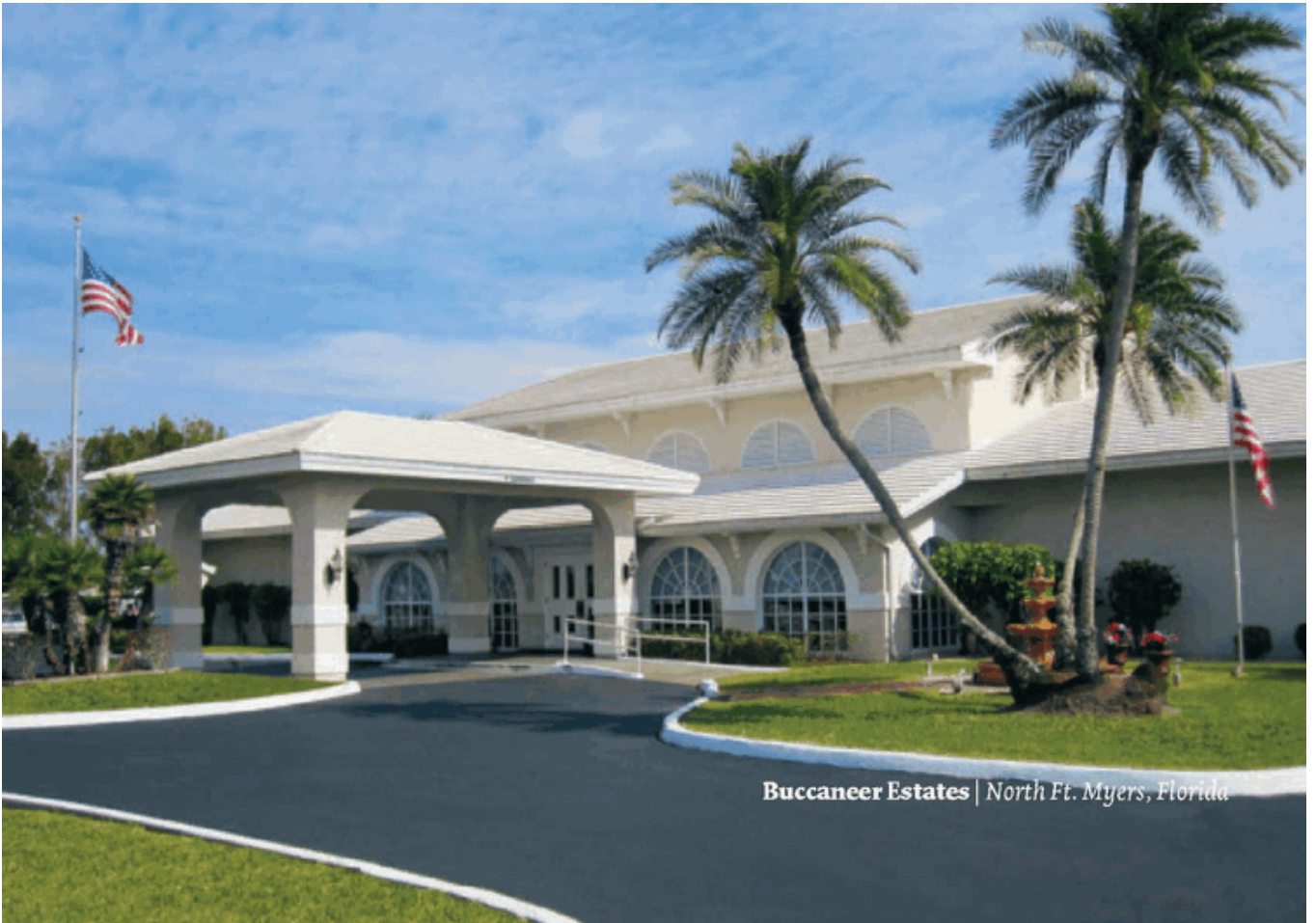
Buccaneer Estates | North Ft. Myers, Florida