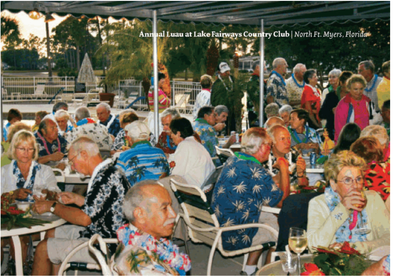
Annual Luau at Lake Fairways Country Club | North Ft. Myers, Florida