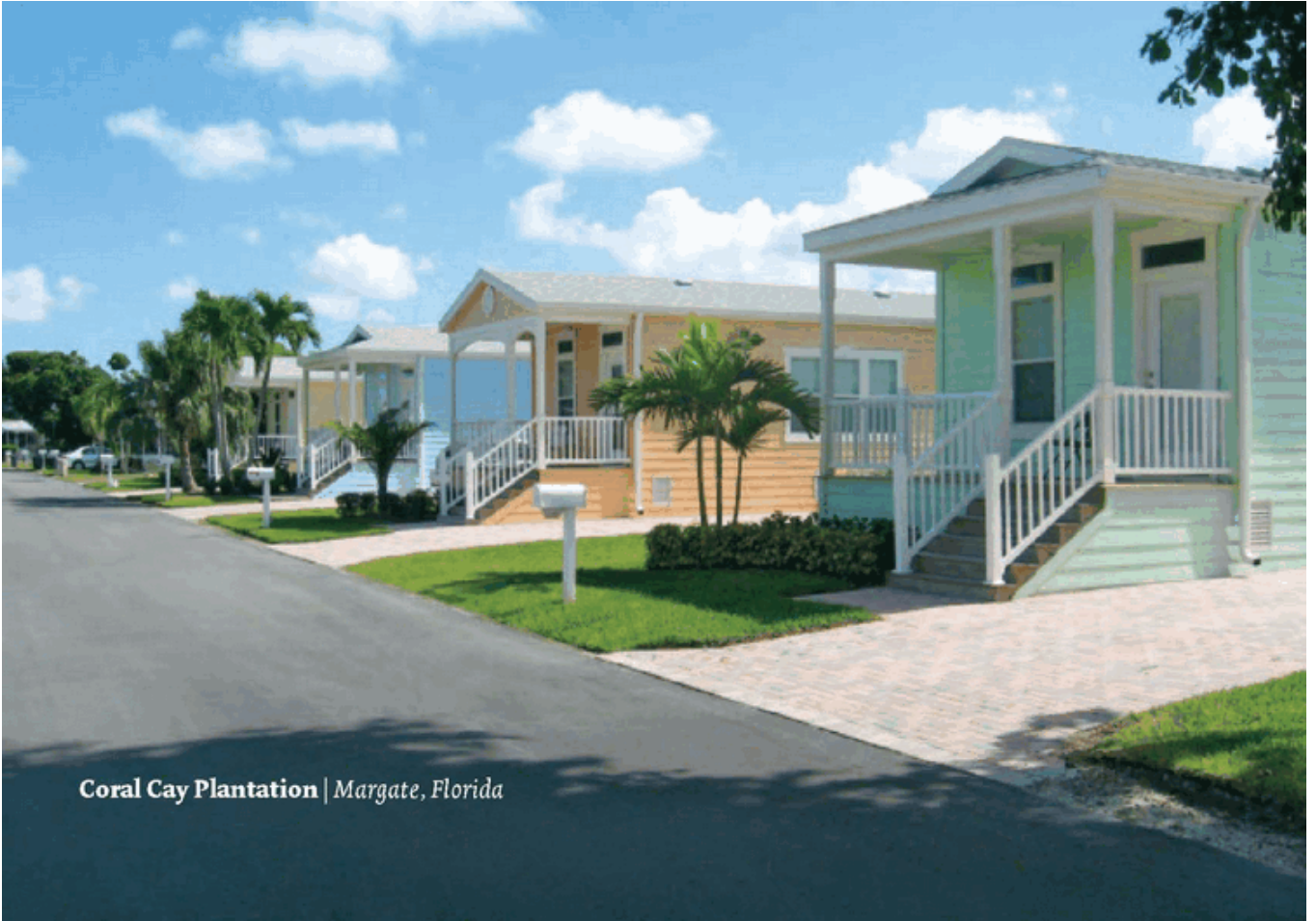
Coral Cay Plantation | Margate, Florida