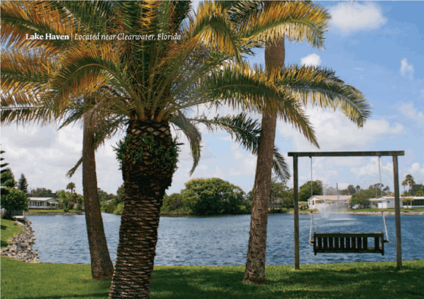
Lake Haven | Located near Clearwater, Florida