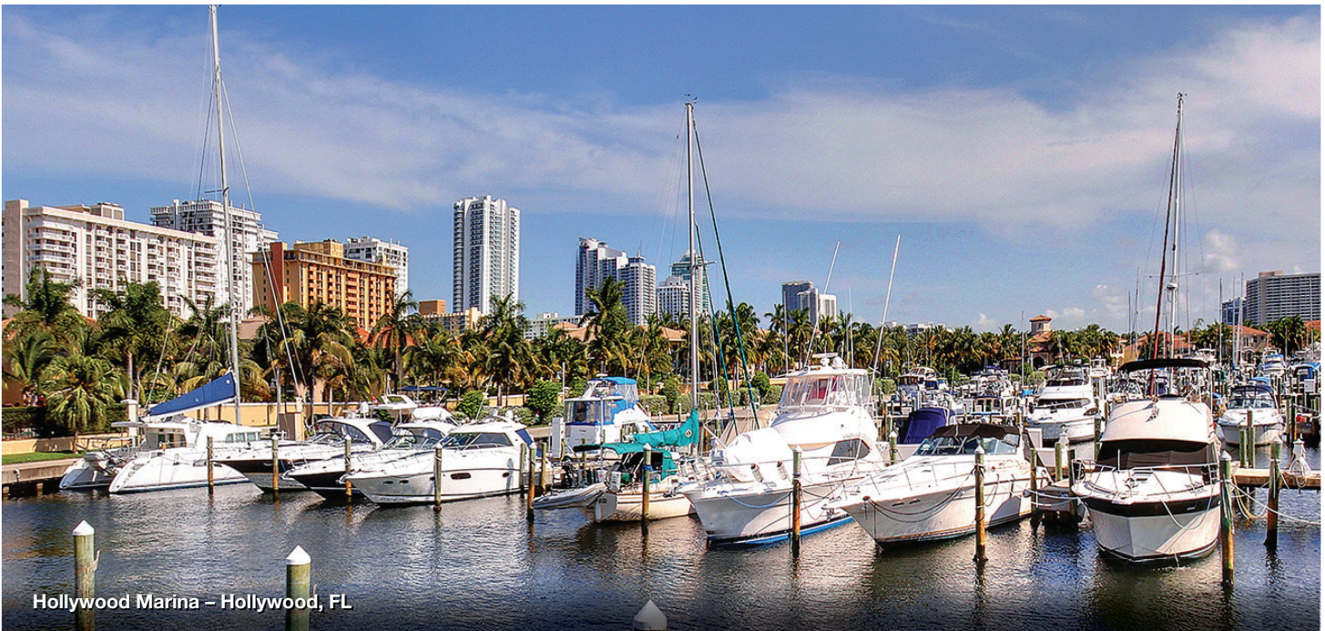
Hollywood Marina – Hollywood, FL