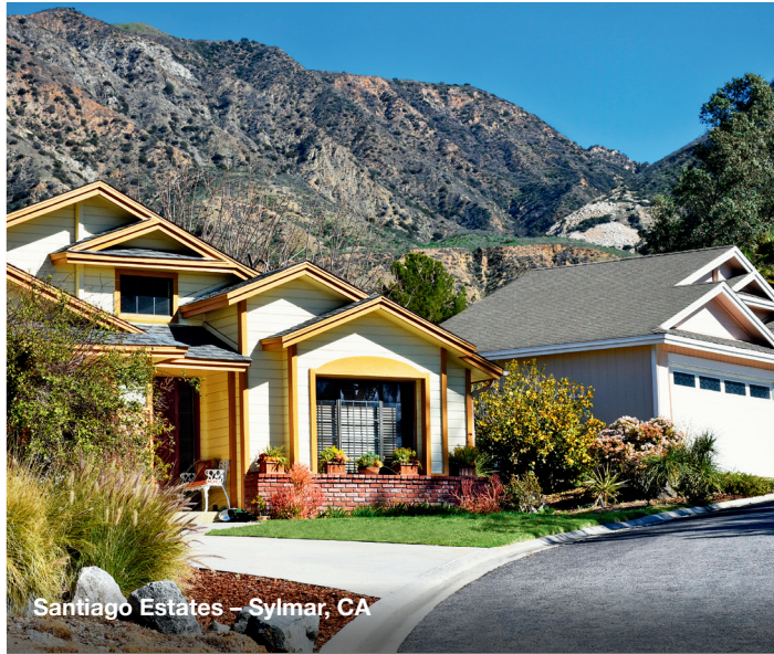
Santiago Estates – Sylmar, CA