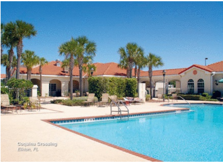
Soquel Crossing Elkton, FL