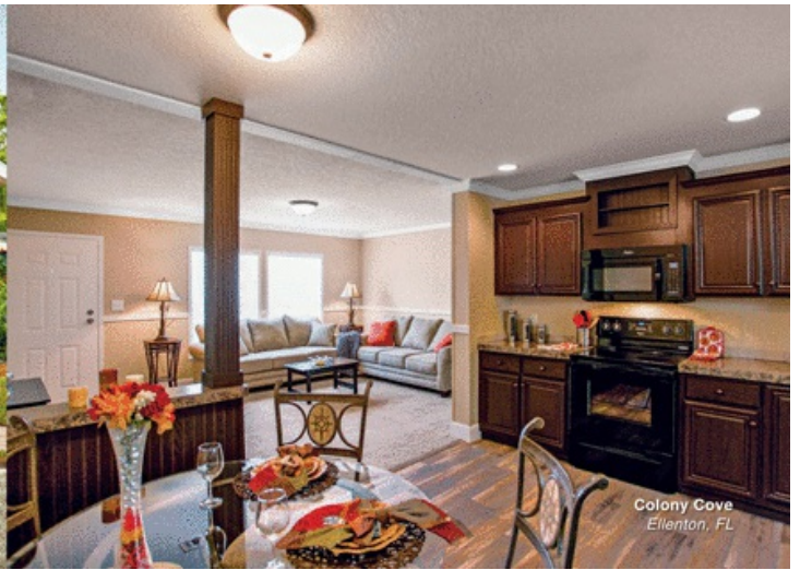
Colony Cove Ellenton, FL