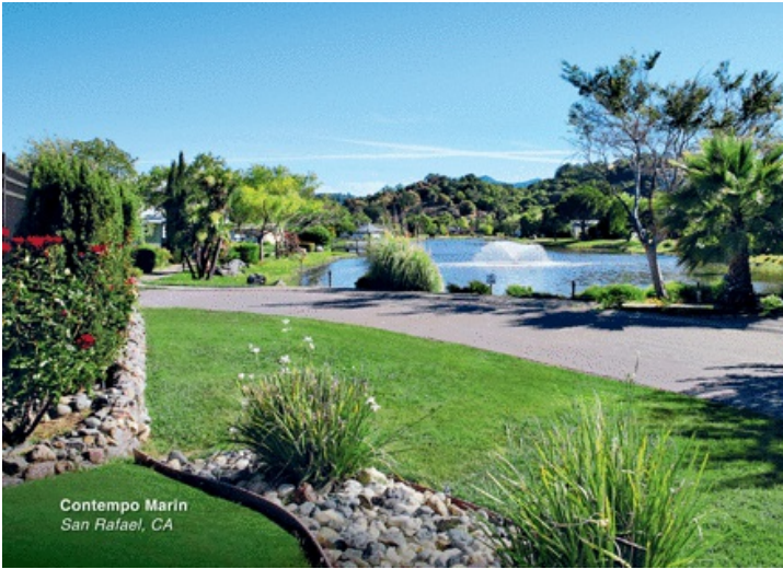
Contempo Marin San Rafael, CA