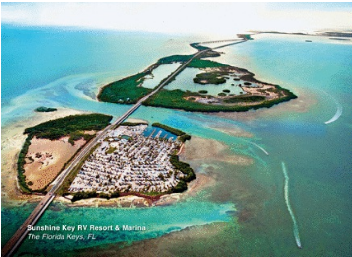
Sunshine Key RV Resort & Marina The Florida Keys, FL