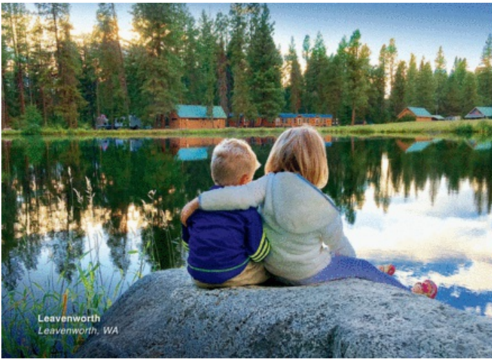
Leavenworth Leavenworth, WA