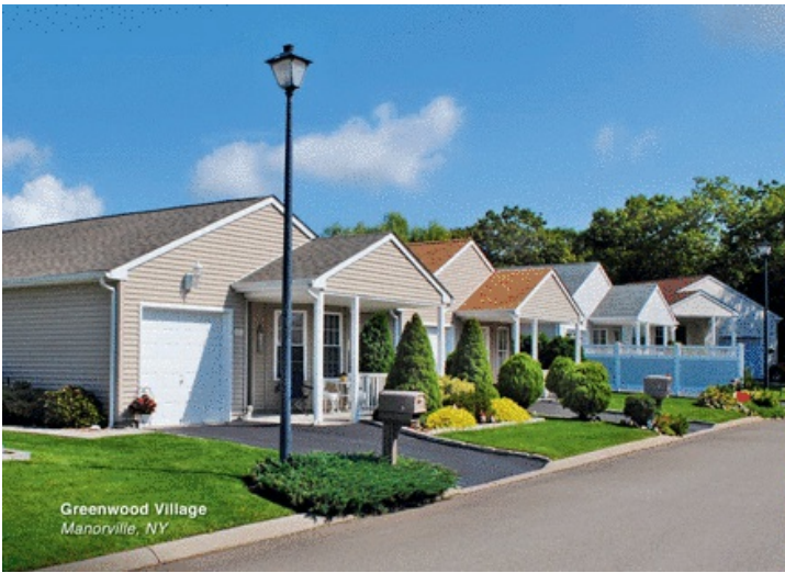
Greenwood Village Manorville, NY