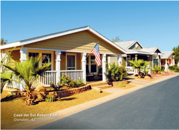
Casa del Sol Resort East Glendale, AZ