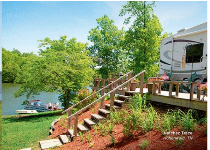
Natchez Trace Hohenwald, TN