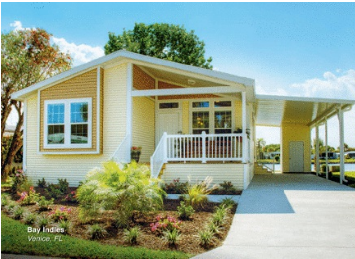
Bay Indies Venice, FL