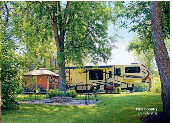
Pine Country Belvidere, IL