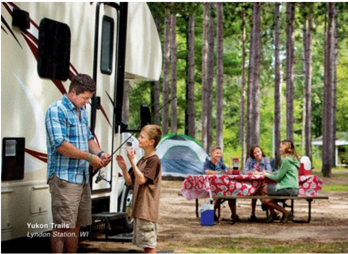
Yukon Trails Lyndon Station, WI