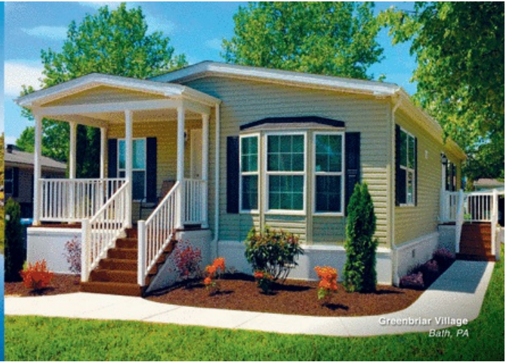
Greenbriar Village Bath, PA