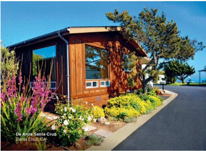
De Anza Santa Cruz Santa Cruz, CA