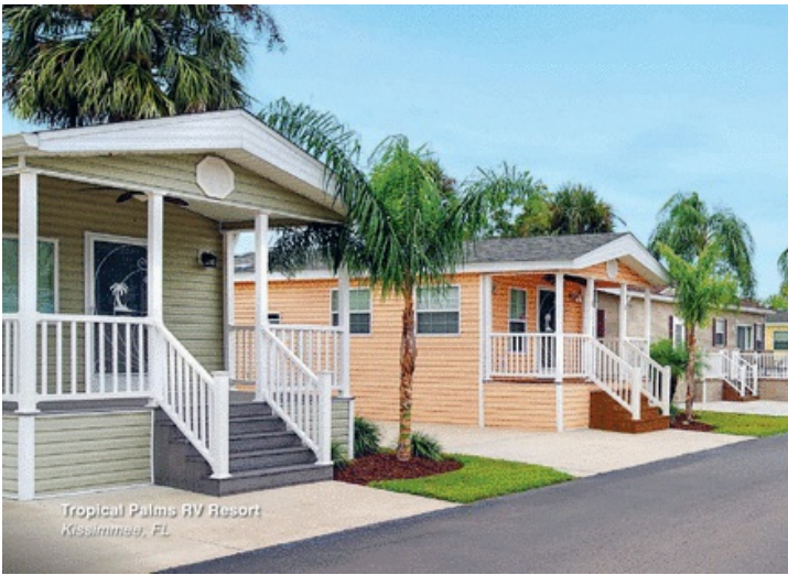
Tropical Palms RV Resort Kissimmee, FL