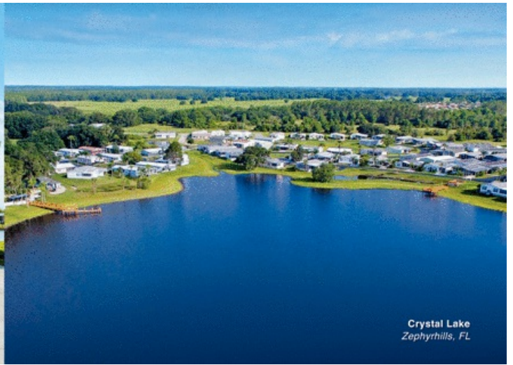
Crystal Lake Zephyrhills, FL