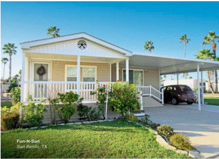
Fun-N-Sun San Benito, TX