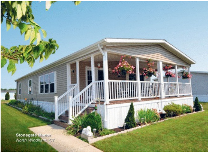
Stonegate Manor North Windham, CT