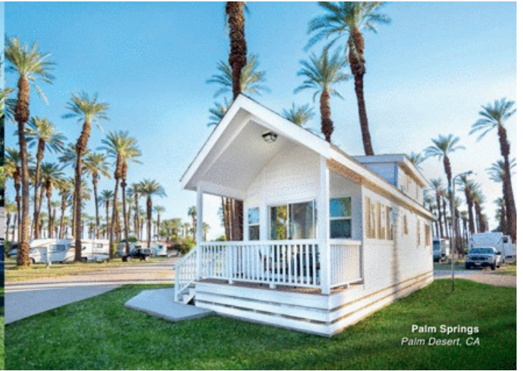
Palm Springs Palm Desert, CA