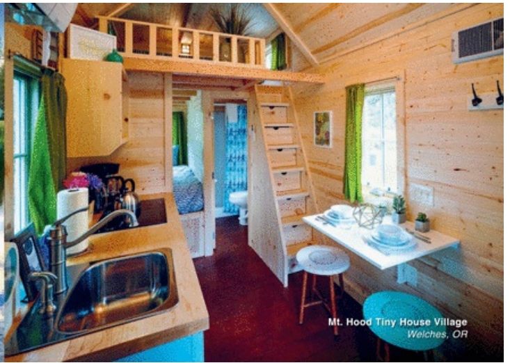
Mt. Hood Tiny House Village Welches, OR