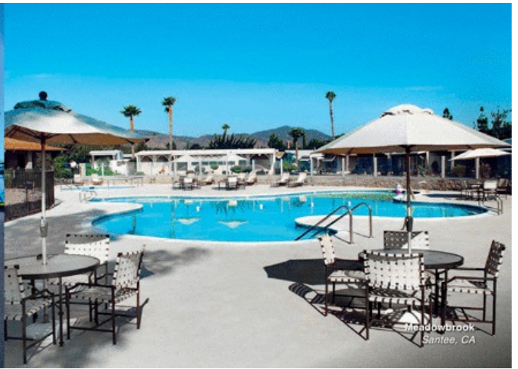
Meadowbrook Santee, CA