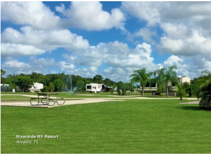
Riverside RV Resort Arcadia, FL