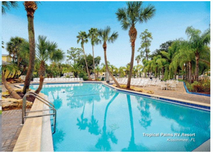
Tropical Palms RV Resort Kissimmee, FL