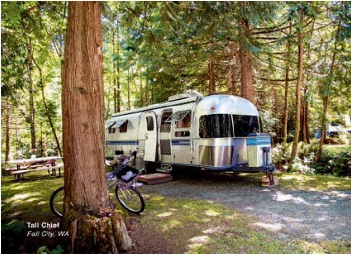
Tall Chief Fall City, WA