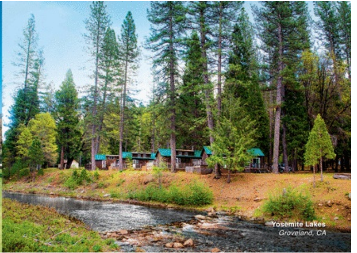
Yosemite Lakes Groveland, CA