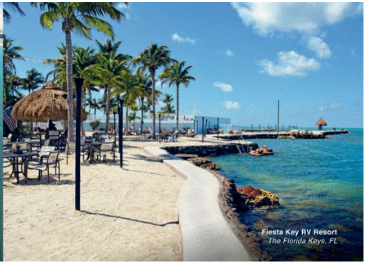
Fiesta Key RV Resort The Florida Keys, FL