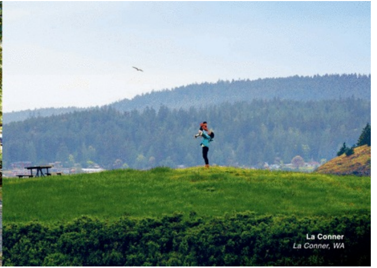
La Conner La Conner, WA