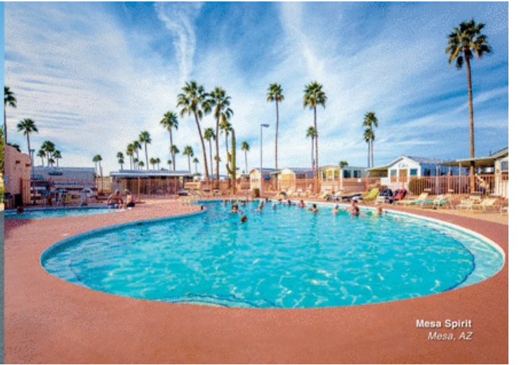
Mesa Spirit Mesa, AZ