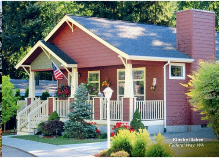
Kloshe Illahee Federal Way, WA