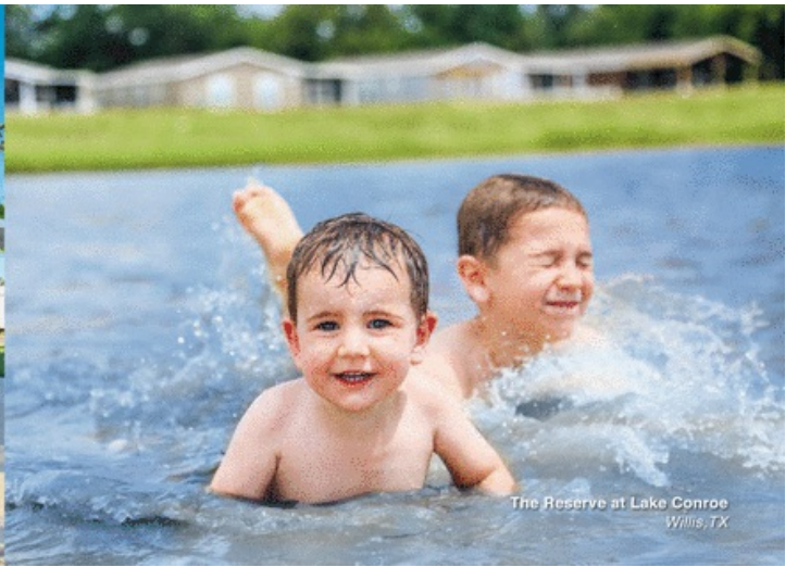
The Reserve at Lake Conroe Willis, TX