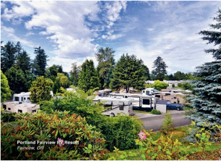
Portland Fairview RV Resort Fairview, OR