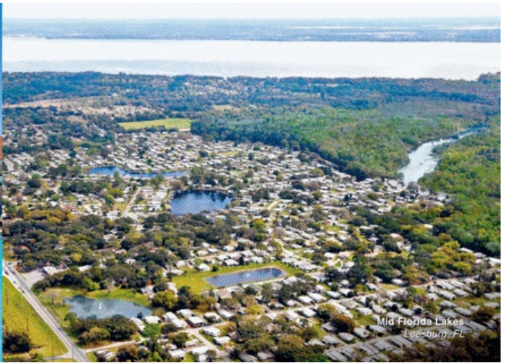
Mid Florida Lakes Leesburg, FL