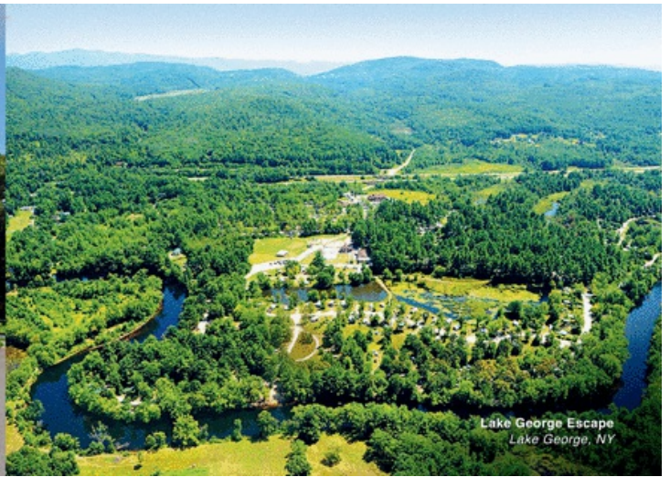
Lake George Escape Lake George, NY