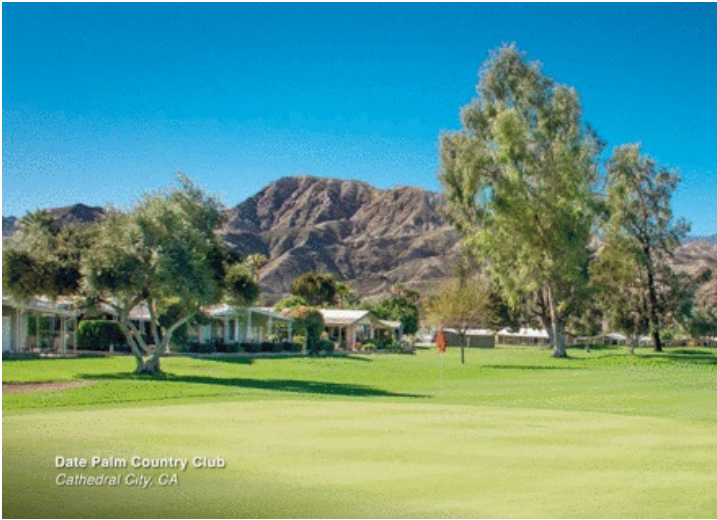
Date Palm Country Club Cathedral City, CA