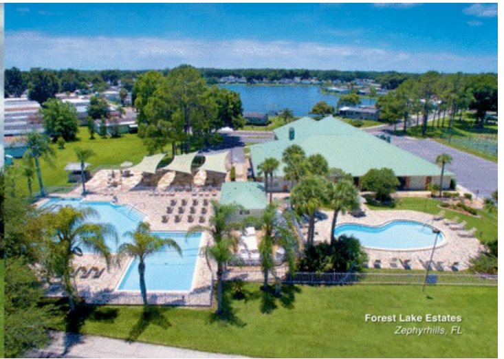
Forest Lake Estates Zephyrhills, FL