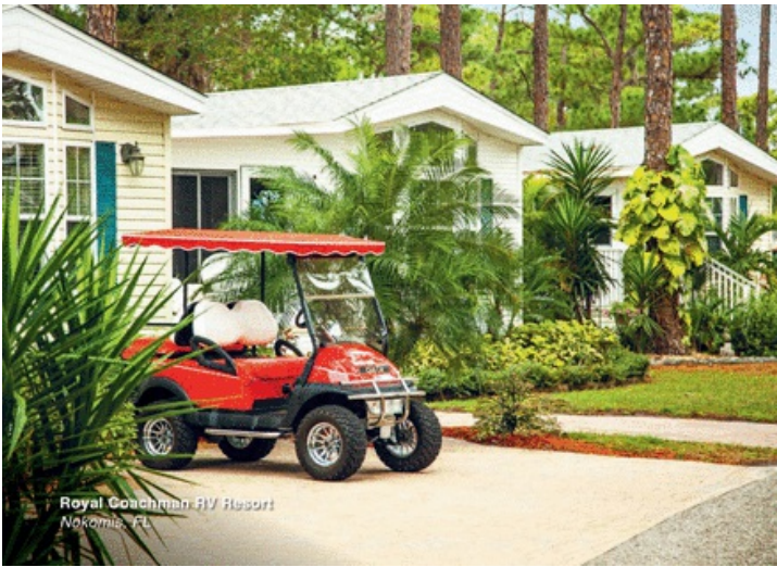
Royal Coachman RV Resort Nokomis, FL