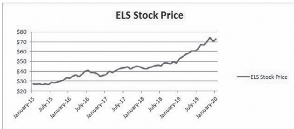
Note: This chart shows the ELS stock price from January 2015 through January 2020.