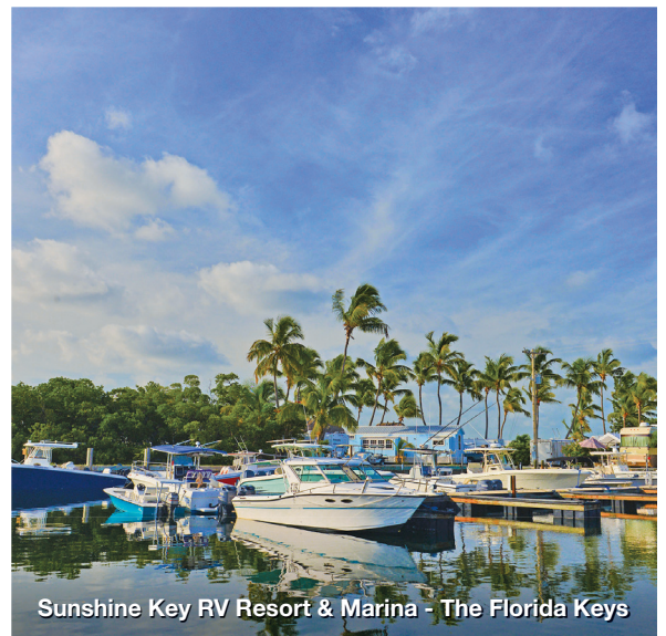
Sunshine Key RV Resort & Marina - The Florida Keys