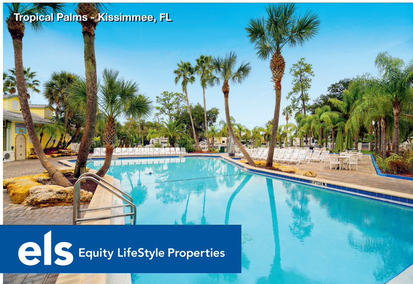
Tropical Palms - Kissimmee, FL