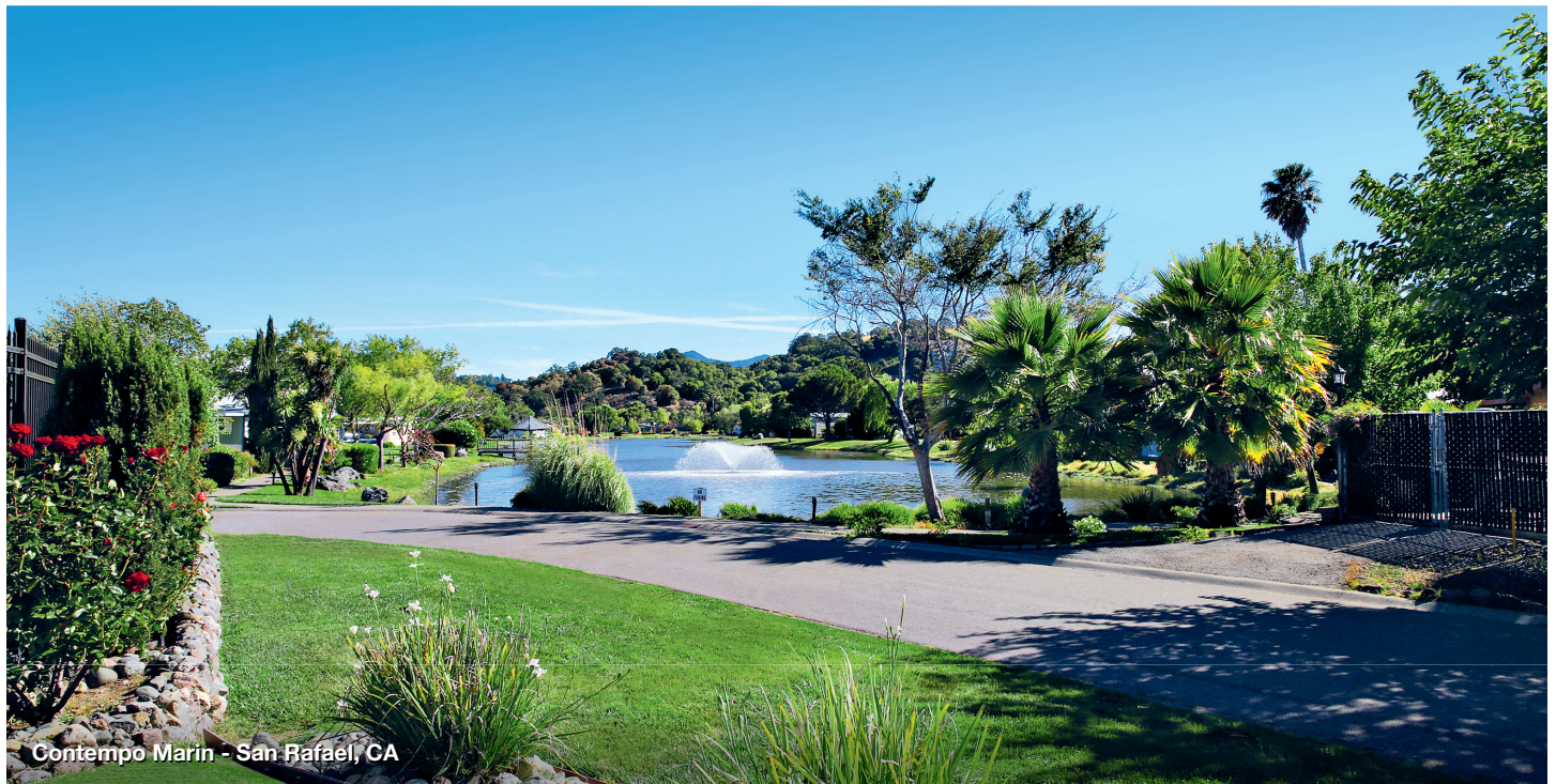
Contempo Marin - San Rafael, CA