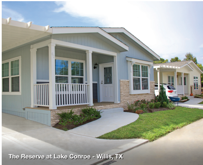
The Reserve at Lake Conroe - Willis, TX