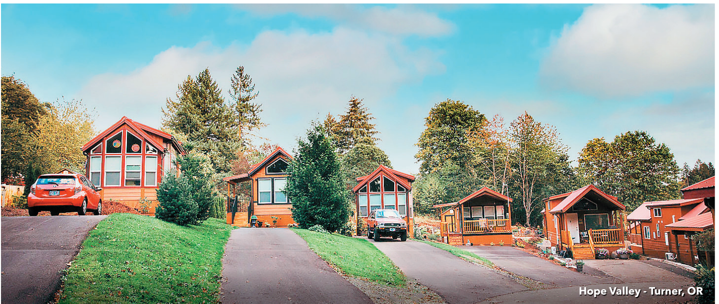
Hope Valley - Turner, OR