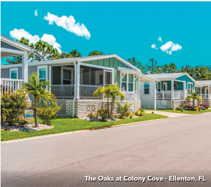
The Oaks at Colony Cove - Ellenton, FL