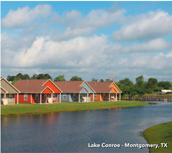
Lake Conroe - Montgomery, TX